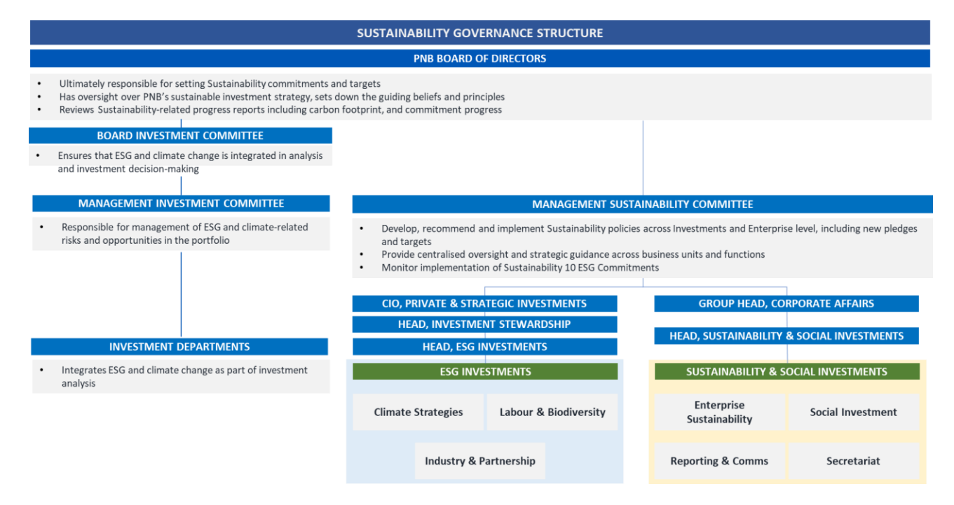
Exhibit 3: PNB's Sustainability Governance Structure

5.1 PNB has established a Sustainability Governance Structure (Exhibit 3) to integrate sustainability and integrity into the decision-making process across the organisation as well as to ensure transparency and accountability of our sustainability journey.